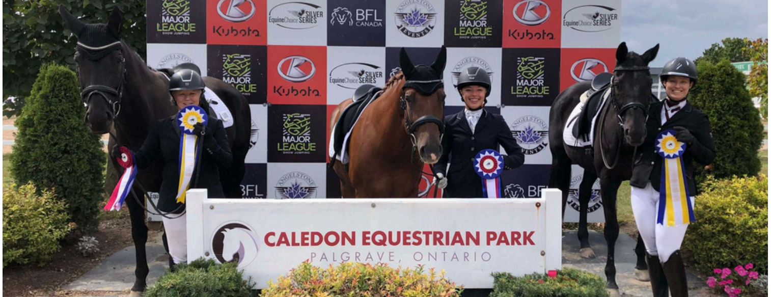
2024 Team Dressage Niagara 2nd Place Western Division